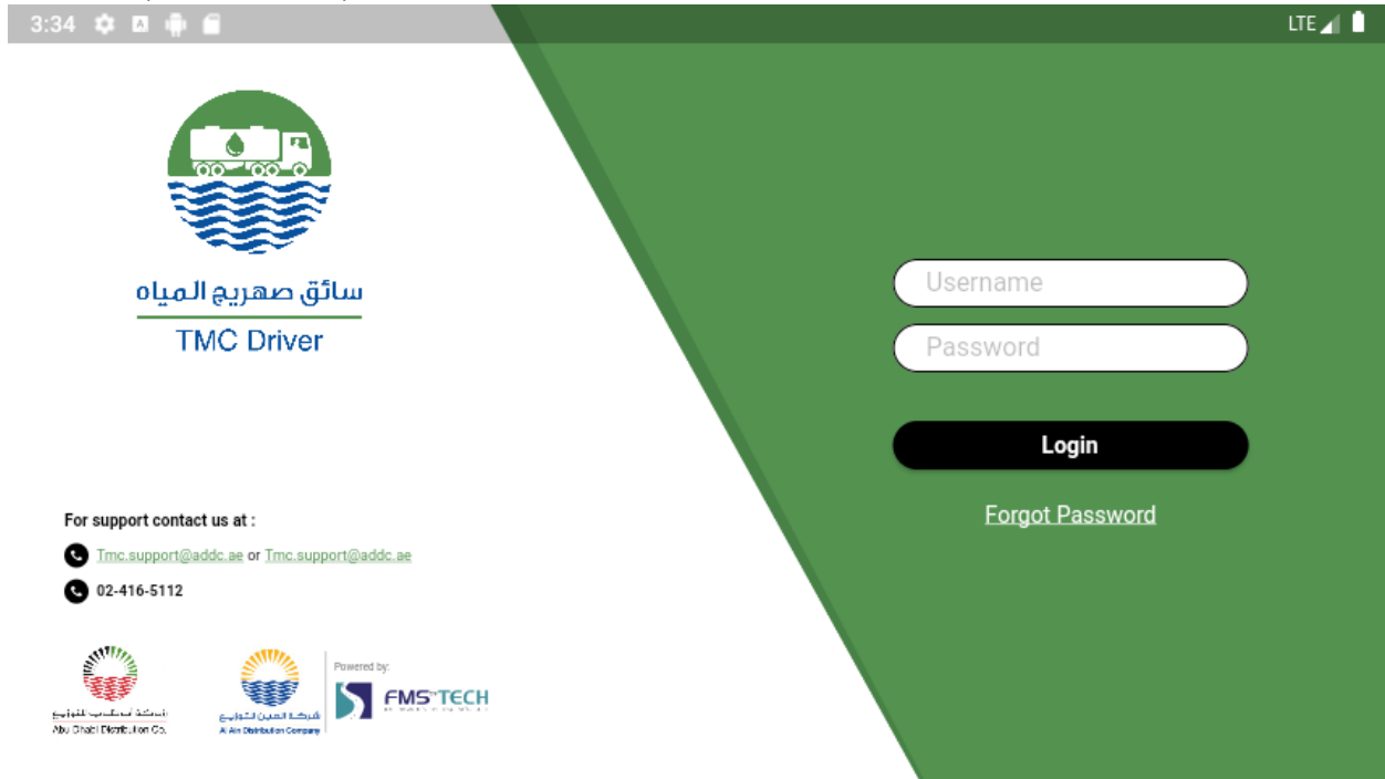
Figure 1 - Login Screen

Log into your account, using the Username and Password provided earlier during the tanker registration phase. Use the navigation bar to easily check your profile, orders & orders history, violations, notifications, and Tariff Offers.