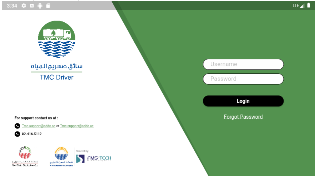
Figure 1 - Login Screen

Log into your account, using the Username and Password provided earlier during the tanker registration phase. Use the navigation bar to easily check your profile, orders & orders history, violations, notifications, and Tariff Offers.