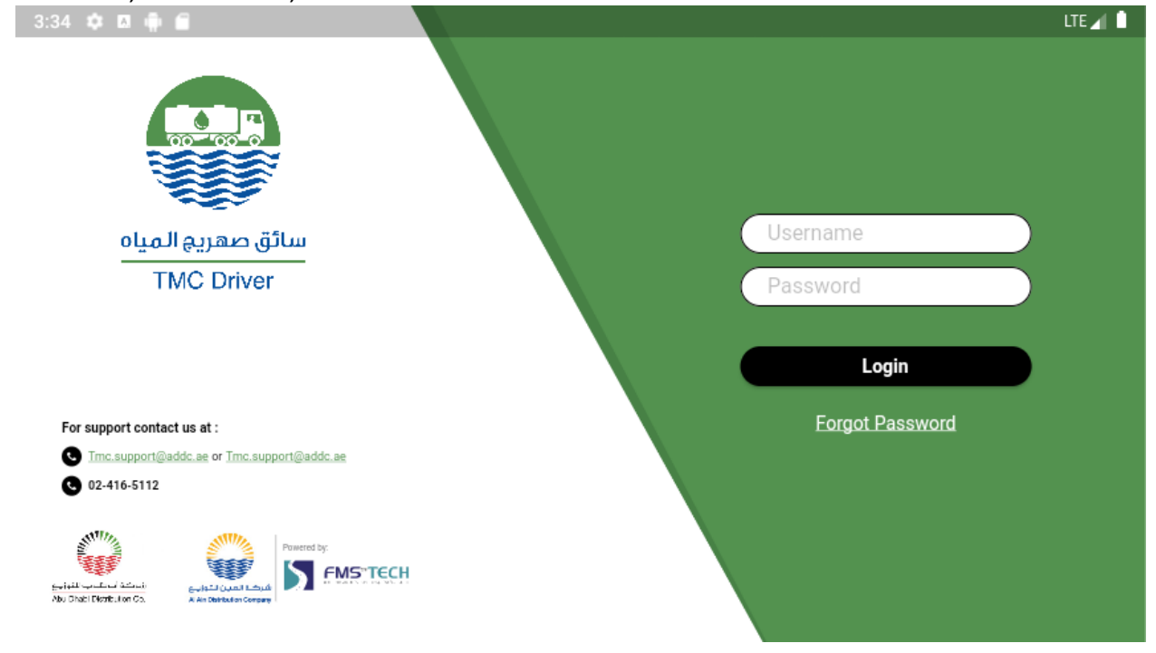
Figure 1 - Login Screen

Log into your account, using the Username and Password provided earlier during the tanker registration phase. Use the navigation bar to easily check your profile, orders & orders history, violations, notifications, and Tariff Offers.