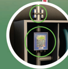
Water Flow Meter