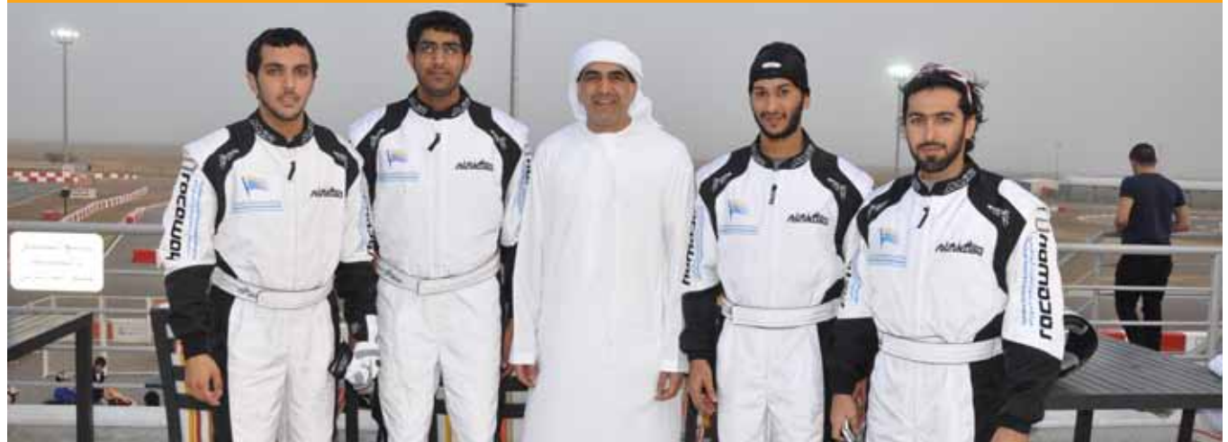
To ADWEA team on winning the first place in Quintessentially Night Race 2010, Endurance Go-Karting Race, held at Al Ain Sportplex on 16 April. We congratulate all the team members on this fantastic win and achievement, wishing them the best in their future sports career.